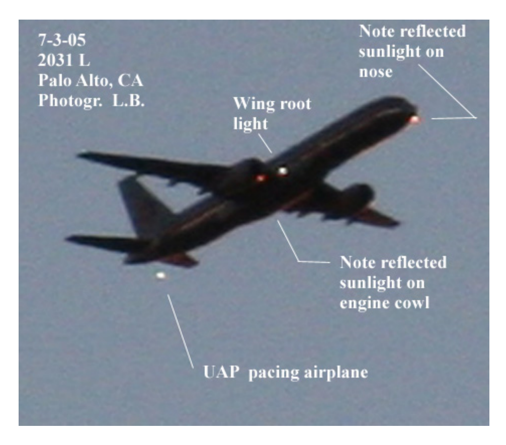
Figure 3. White Spherical UAP Pacing Airliner. (From Haines, 2007)

The most alarming aspect of this case, aside from the possibility that these phenomena may adversely affect vital avionic systems, is that the aircrew was probably unaware of the incident. These cases of ground-based observations of UAP pacing or following aircraft are rather common. It is important to note that these cases have the potential to trigger aviation security alerts and also might be misidentified as ordinance.