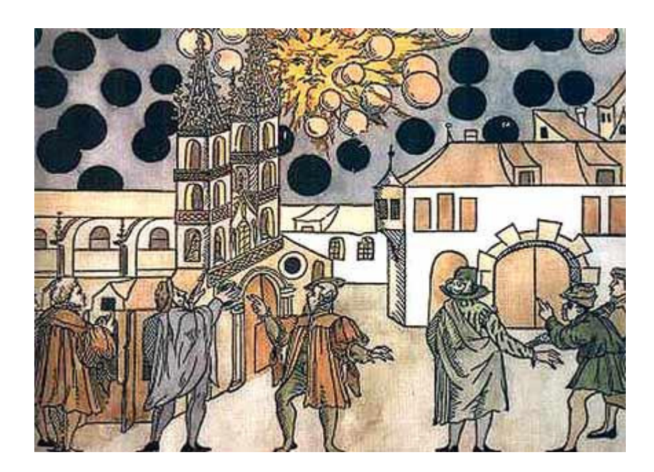
Figure 4. Block Print depicting Incident above Basel, Switzerland, August 1566

More contemporary descriptions of spherical UAP arose during WWII when spherical UAP encounters with aircraft were reported by all participating air forces. An article from the New York Times, Dec. 13, 1944 stated: