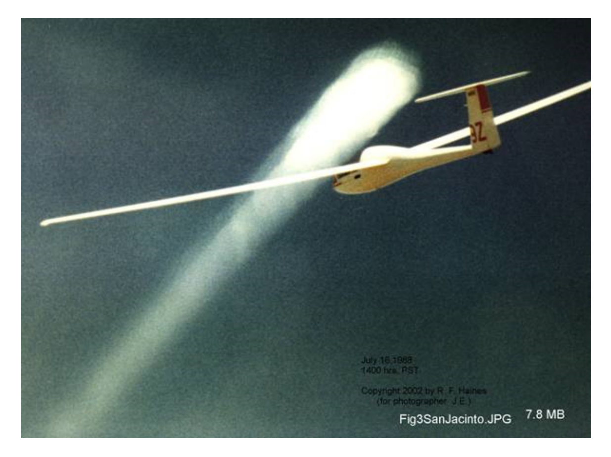
Figure 1. Spherical UAP and Sailplane. (From: Haines, 2002)

In addition to the forty four spherical UAP cases derived from Dr. Haines' paper, NARCAP has conducted two analyses of photographs purporting to show the presence of a spherical UAP. The first case is NARCAP Technical Report 7 entitled "<u>Analysis of a Photograph of a High Speed Ball of Light</u>" (Haines, 2002).