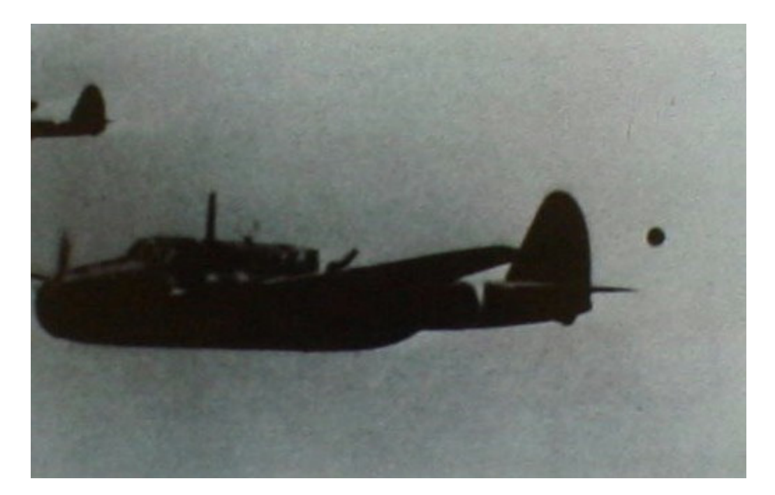
Figure 5. Spherical UAP in Aircraft Formation

The UAP report published in 2006 by the United Kingdom Ministry of Defense, Unidentified Aerial Phenomena in UK Air Defense Region (aka The "Condign Report") was a public acknowledgement that UAP exist and it offers a hypothesis for the source of UAP reports. This study can be reviewed on the website of the Ministry of Defense of the United Kingdom.